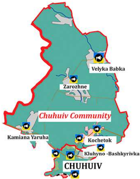
Map of air-raid warning systems in Chuhiv Community